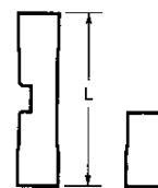
Step Down Assembly*