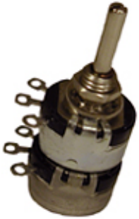
Representative photograph, actual product appearance may vary.