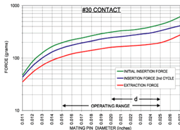
The insertion/extraction/normal force characteristics above were derived using a 30 microinch gold plated contact and polished steel gauge pins having a bullet-shaped tip.

†Since BeCu loses its spring properties over time at high temperatures; it is rated for continuous use up to 150°C. For applications up to 300°C, Mill-Max offers many contacts in Beryllium Nickel. Contact Tech Support for more info.