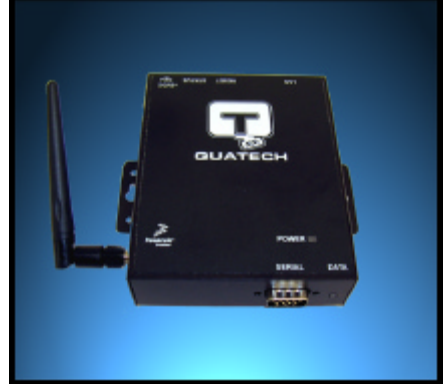
Quatech wireless (802.11b) device servers are available in 1 or 2-port configurations.

When you need the ultimate in wireless device server performance, ease of use and flexibility, specify Quatech.