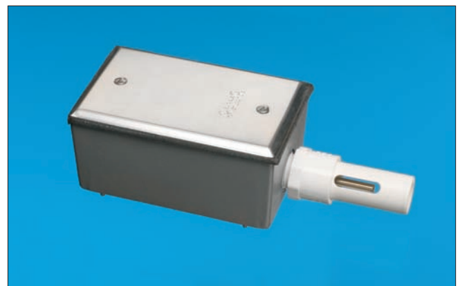
Outdoor Air Sensor with Weatherproof Box