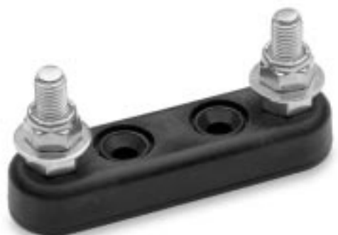
Fuseblock - 4164

The only controlled copy of this Data Sheet is the electronic read-only version located on the Bussmann Network Drive. All other copies of this document are by definition uncontrolled. This bulletin is intended to clearly present comprehensive product data and provide technical information that will help the end user with design applications. Bussmann reserves the right, without notice, to change design or construction of any products and to discontinue or limit distribution of any products. Bussmann also reserves the right to change or update, without notice, any technical information contained in this bulletin. Once a product has been selected, it should be tested by the user in all possible applications.