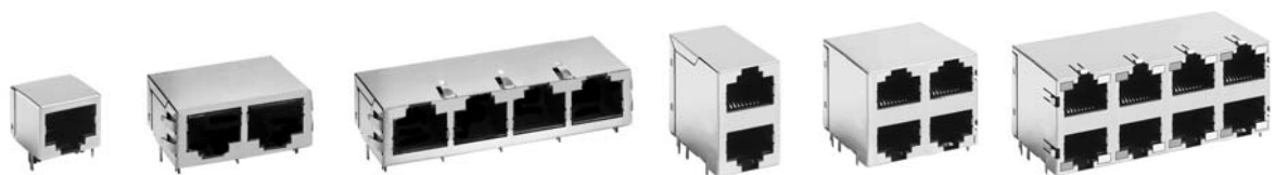
RJ Connectors, CAT. 5, Through Hole (THT)