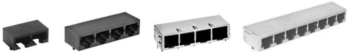
RJ Connectors, Multi-Port, 1XN, Side Entry, Through Hole (THT)