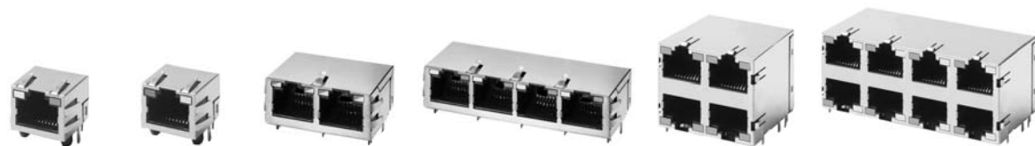
RJ Connectors, Side Entry with LEDs, Through Hole (THT)