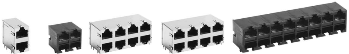
RJ Connectors, Multi-Port, 2XN, Side Entry, Through Hole (THT)