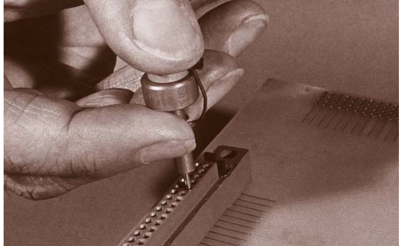
SEAT PLUNGER AND REMOVE CONTACT AND TOOL