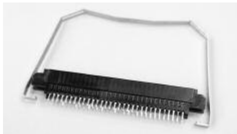
Part Number 6364125-x (Connector) Part Number 1364124-x (Spring Clip) Designed for Intel VRM 9.0 Specifications

Note: All part numbers are RoHS compliant.