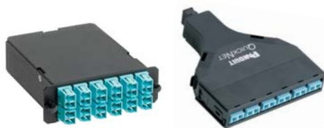
FC ^ -24-10Y