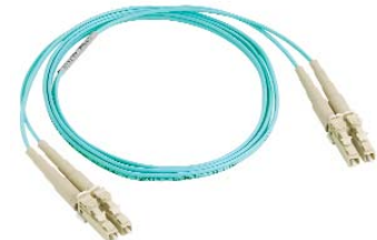
F ^ E10-10M ^ Y

^Substitute for fiber type: Z (OM4 – 10Gig™ 50/125µm), X (OM3 – 10Gig™ 50/125µm), 5 (OM2 – 50/125µm), 6 (OM1 – 62.5/125µm) and 9 (OS1 – 9/125µm). For plenum (OFNP) rated cable, place a P after the fiber type (^) and drop the Y.