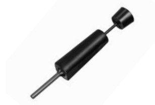
Extraction Tool Part No. 305183