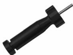
Extraction Tool Part No. 455822-2