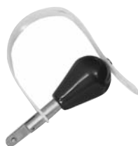
Universal Handle Part No. 465629-□*

Requires Installation Tip: Part Number 465468-1 (≤ .185 [4.7] insul. dia. and/or crimp width) or Part No. 465488-1 (> .185 [4.7] insul. dia. and/or crimp width).