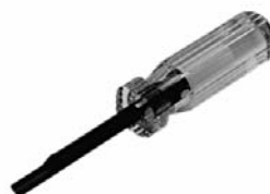
Extraction Tool Part No. 465644-1