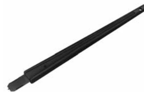
Extraction/Lance Reset Tool Part No. 843996-3