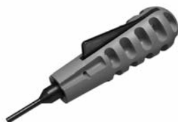
Extraction Tool Part No. 318851-1