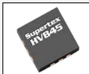
12-Lead QFN/MLP (K7)