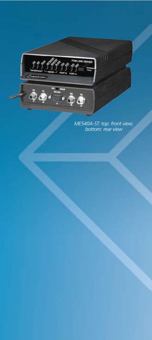
ME540A-ST: top: front view; bottom: rear view