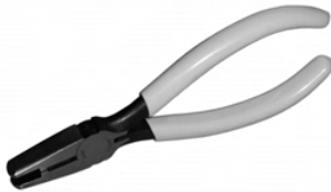
Economy hand tool Part number 790162-1