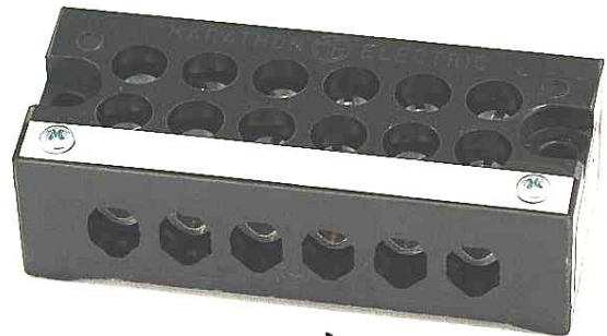
6 pole shown

1100 Series Deadfront Type 65 Amps, 600 Volts AC/DC