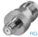
FIG. 23 RFT-1241-4