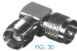
FIG. 30 RFU-633