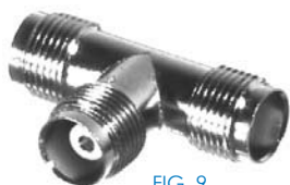
FIG. 9 RFT-1229