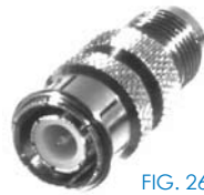
FIG. 26 RFT-1242