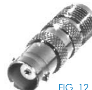
FIG. 12 RFT-1232