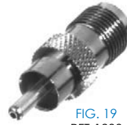
FIG. 19 RFT-1238