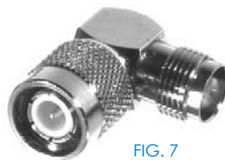
FIG. 7 RFT-1227, LF