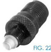
FIG. 22 RFT-1240-1