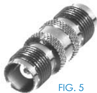
FIG. 5 RFT-1225