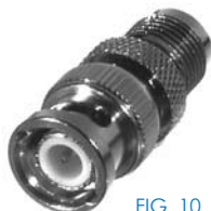
FIG. 10 RFT-1230