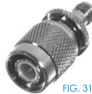
FIG. 31 RSA-3472