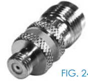
FIG. 24 RFT-1241-5