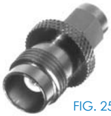
FIG. 25 RFT-1241-6