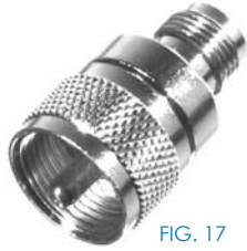
FIG. 17 RFT-1236