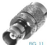
FIG. 11 RFT-1231