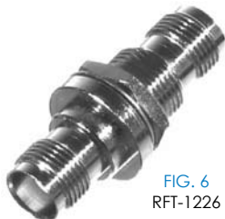
FIG. 6 RFT-1226