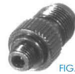
FIG. 27 RFT-1243