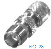
FIG. 28 RFU-623