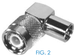
FIG. 2 RFE-6109