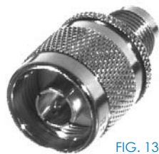
FIG. 13 RFT-1233