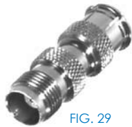
FIG. 29 RFU-623-5