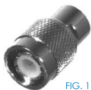
FIG. 1 RFE-6108

BODY: C - BLACK CHROME N - NICKEL PIN/CONTACT: G - GOLD DIELECTRIC: T - TEFLON