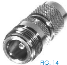
FIG. 14 RFT-1234