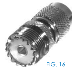
FIG. 16 RFT-1235

PHOTOS FOR REFERENCE ONLY, SHOWN AT 100% ACTUAL SIZE.