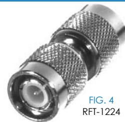
FIG. 4 RFT-1224