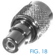
FIG. 18 RFT-1237