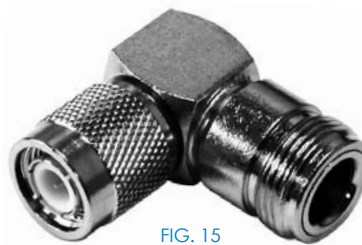
FIG. 15 RFT-1234-11