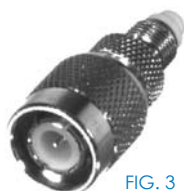
FIG. 3 RFE-6155