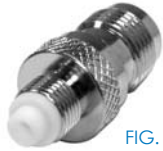
FIG. 21 RFT-1240