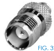
FIG. 32 RSA-3473