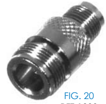
FIG. 20 RFT-1239