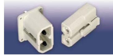
Amphe-PD™ Receptacle and plug