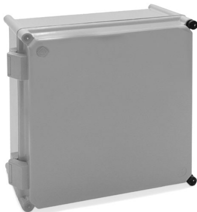
Non-metallic Hinges & Cover Screws

Opaque gray cover with cover screws and non-metallic hinges