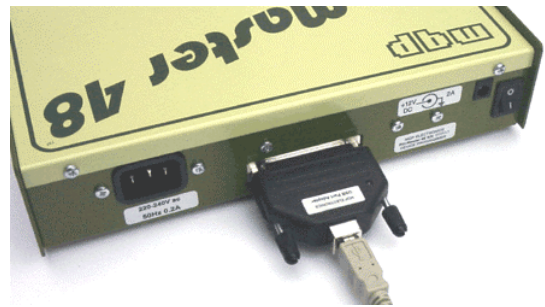
USB Adapter fitted to Pin-Master 48

There has been a trend away from fitting the traditional Serial or Parallel ports on computers, particularly laptops. Instead USB has become the connection of preference. MQP Electronics has developed this USB Port Adapter to provide full compatibility with the Parallel Port Protocols of all our existing programmers. There is no reason for the changing nature of PC technology to prevent you from continuing to benefit from your investment in programming equipment.