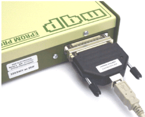
USB Adapter fitted to Model 200