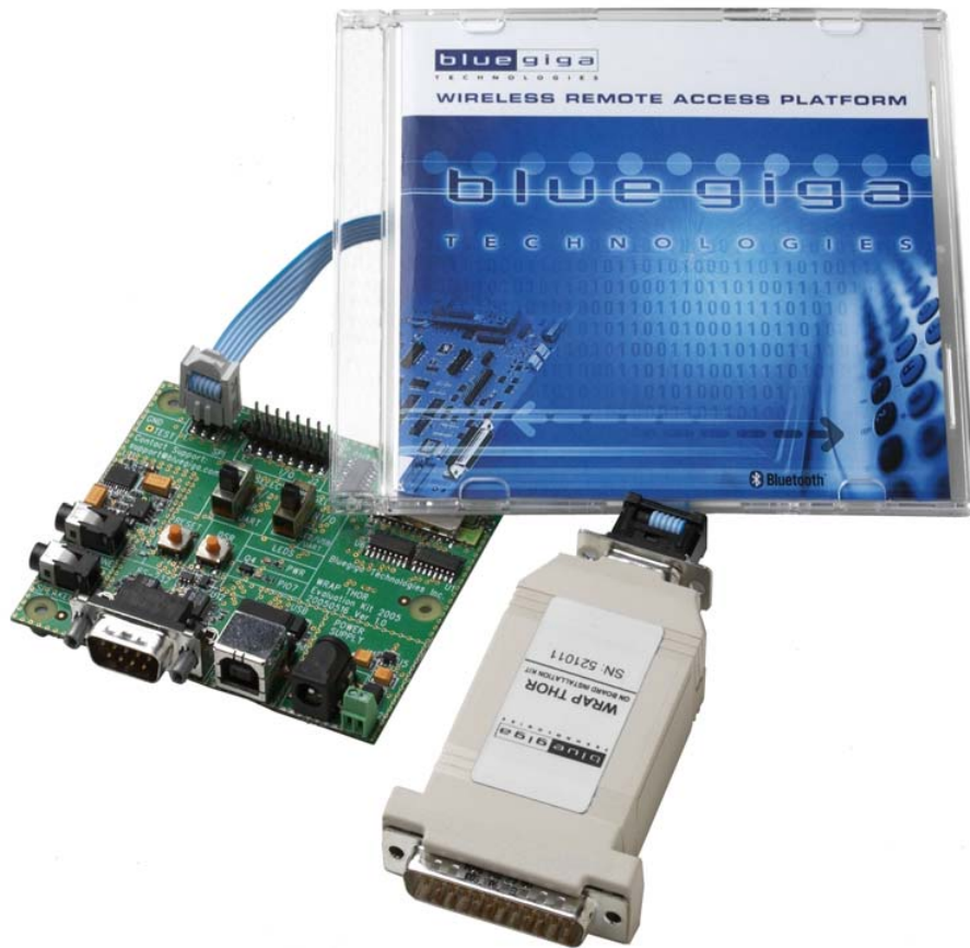
Figure 1: WT11 Evaluation Kit, Onboard Installation Kit and CD