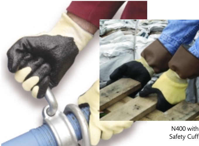
N400 with Safety Cuff