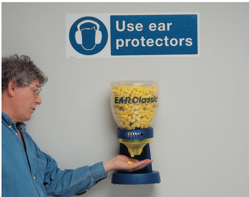
The E·A·R 'One Touch' can be wall mounted or free standing

Unobstructive access from front, or either side permits one hand operation by a clockwise or anticlockwise motion.