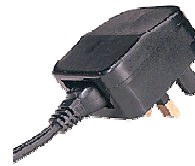
COVER SNAPS SHUT & SECURED WITH SCREW

The American standard plug adaptor is the latest converter plug from the Powerconnections range. This product also converts Japanese and Chinese plugs to BS1363.