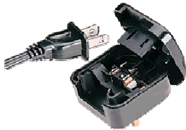
2 PIN PLUG