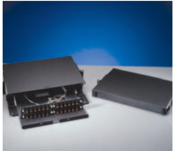
Closet Connector Housings (CCH-02U and CCH-01U) | Photo CPC71