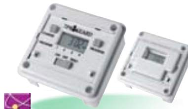
EL11/EMU11 (EL17/EMU17 shown with cover)