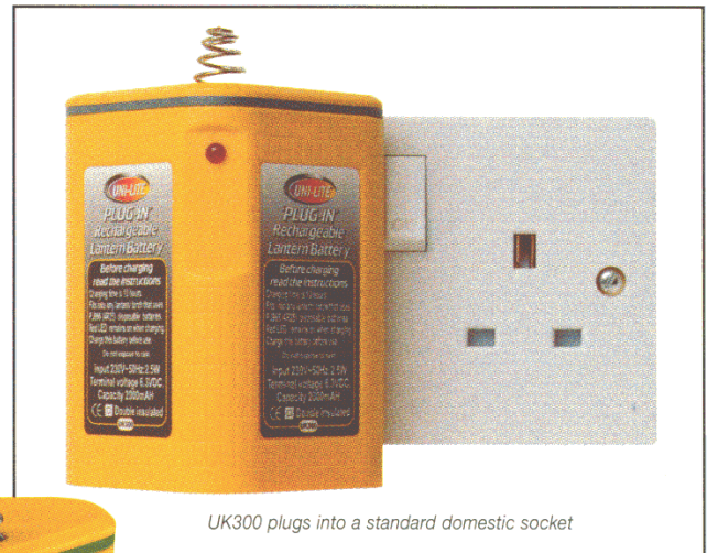
UK300 plugs into a standard domestic socket