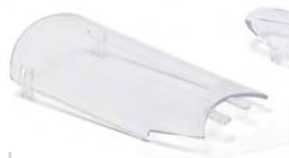
11012 X-1 Replacement Lens