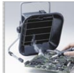
FX-50 Fume Exhauster

* Airflow and noise level are nominal numbers. Available in 115 VAC only.