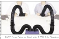
PACE Fume Extractor fitted with 2 ESD Safe FlexArms

(Part Number 8886-0745) contains everything needed to mount an ESD Safe Flex-Arm to a workbench. The Kit includes: (1) ESD Safe Flex-Arm (Part Number 8886-0750), (1) Quick-mount Bench Mounting Bracket Kit (Part Number 8886-0745).