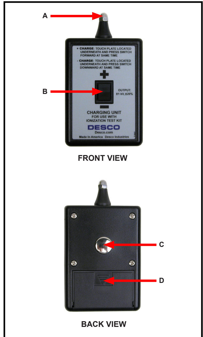
Figure 3. Charger features and components

A. Output Contact: The output contact is connected to an internal power source. When the touch plate located underneath the unit is connected to ground, the output contact will provide a charge of the indicated polarity. The charger is designed so that an operator can press the rocker switch and touch the plate simultaneously with the fingers of the same hand.