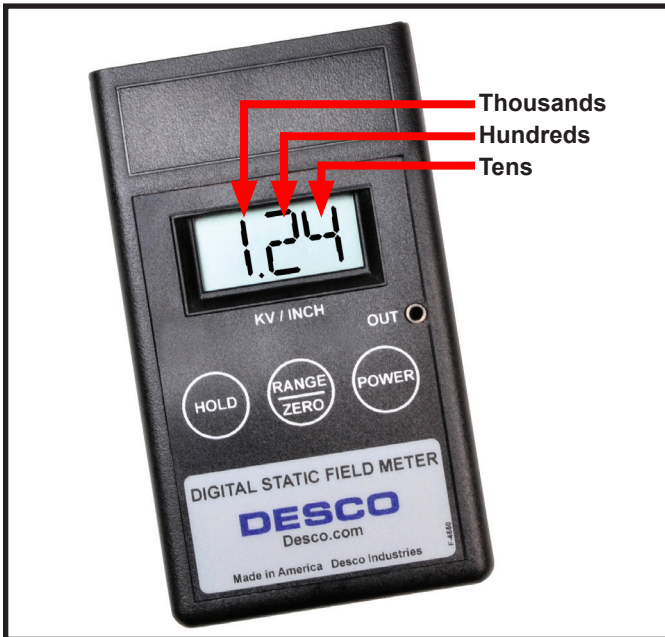
Figure 6. Reading the Digital Static Field Meter while in the \pm 20 kV range

Press the HOLD button to freeze the reading from the object on the display and the analog output signal. This feature allows the operator to move the Meter where it may be more easily read or saved for later reference.