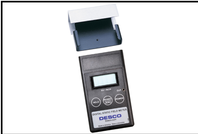
Figure 4. Installing the 19498 Conductive Plate

The Digital Static Field Meter's case has two slots along its sides. The top slot is closest to the face of the instrument. Slide down the tabs of the Conductive Plate into the top slot of the Meter's case as far as they go (see Figure 4).