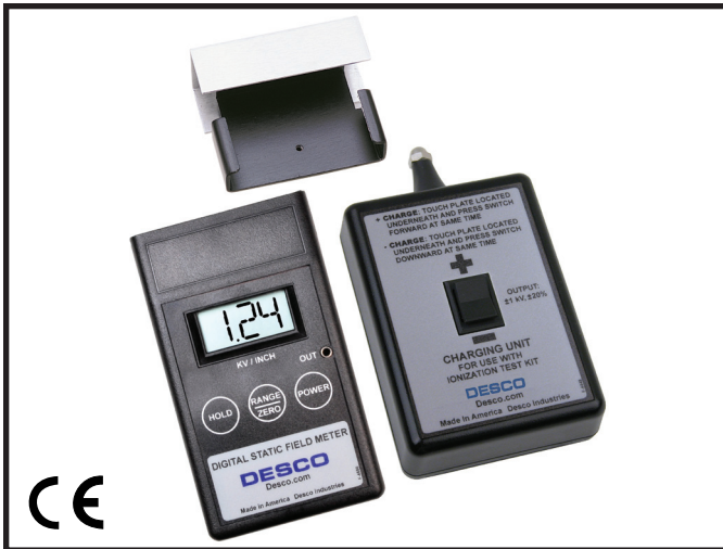
Figure 1. Desco 19493 Ionization Test Kit