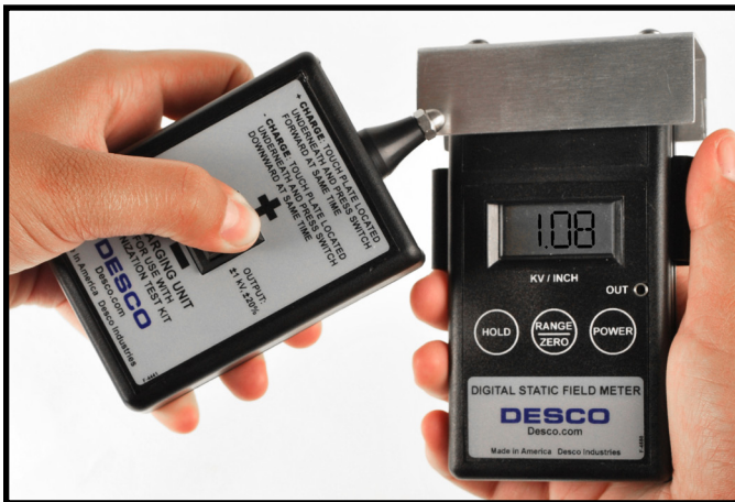
Figure 8. Taking decay measurements

IMPORTANT: A ground path must be provided between the touch plate of the Charger and the ground reference of the Field Meter. This is normally provided by holding the Charger in one hand and the Field Meter with Conductive Plate in the other.