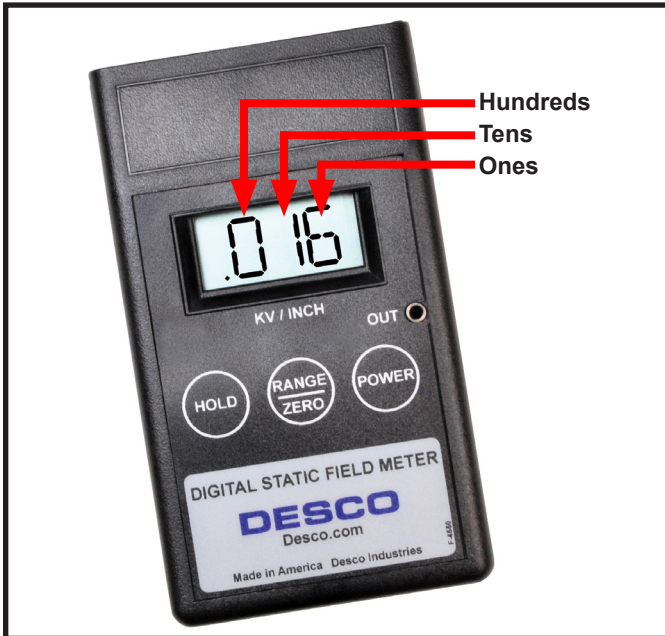
Figure 7. Reading the Digital Static Field Meter while in the \pm 2 kV range

Per ESD TR53-2006 Compliance Verification of ESD Protective Equipment and Materials Air Ionizer Test Procedure Initial Test Setup "Measurements should be