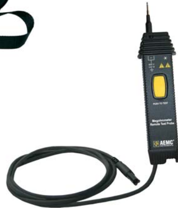
Remote Test Probe for use with Models 1040 & 1045 Catalog #2118.97