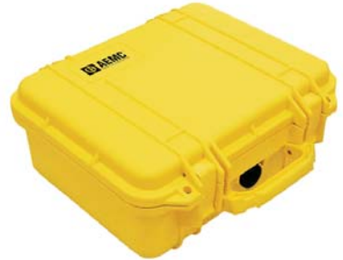
Field Case for use with all models Catalog #2118.98