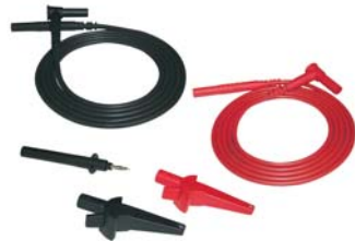
Test Leads standard with all models Catalog #2119.01