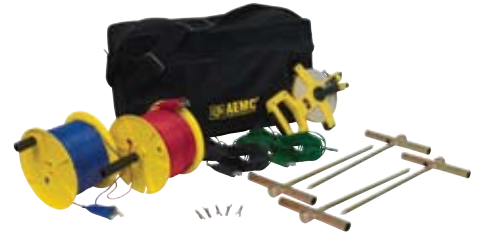
Test Kit for 4-Point testing includes two 500 ft color-coded leads on spools (red and blue), two 100 ft color-coded leads (green and black), one 30 ft lead (green), four 14.5" T-shaped auxiliary ground electrodes, one set of five spaded lugs, 100 ft tape measurer and carrying bag. Catalog #2135.37