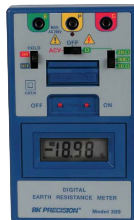
Earth Voltage Measurement