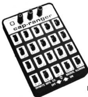
Model No. 3430

An economical, portable capacitance selector with three binding posts, one to ground the metal case.