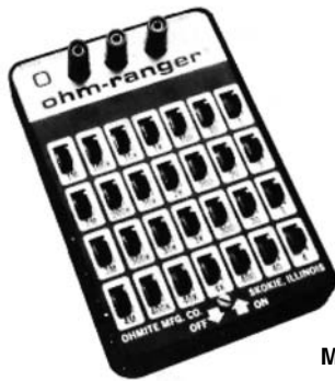
Model No. 3420

An economical, portable resistance selector with a range to over 11,000,000 ohms, in 1 ohm increments. Has three binding posts, one to ground the case.