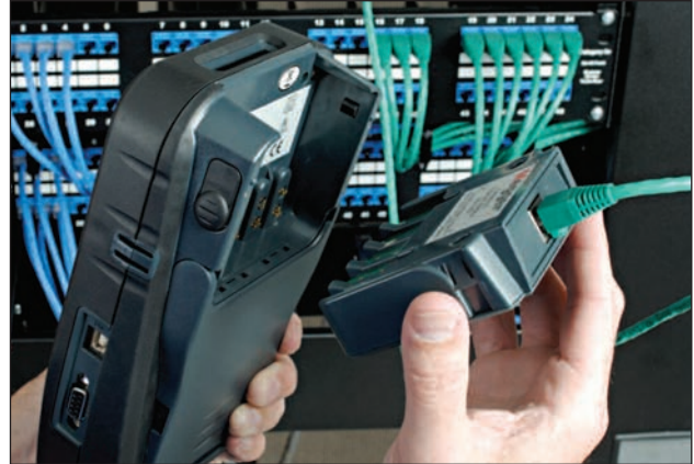
SCT Series adapter employs new "connector-less" adapter technology.

The SCT Series speeds the user through link diagnosis with powerful diagnostic tools found only on the Megger SCT. The instrument pinpoints the distance to link disturbances on each measured pair and displays this data in multiple helpful formats. After completing a certification test the user can choose to generate and display diagnostic results. Diagnostic wiremap displays the length to an open or short on each pair. Diagnostic TD NEXT and TD Return Loss measurements quickly and accurately calculate the distance to and the strength of all disturbances on each measured pair on a percentage scale, where values exceeding 100% are an indication of a link failure. Summary TD NEXT and TD Return Loss display the distance and strength of the single worst disturbance for pinpointing the worst fault. Detailed TD NEXT and TD Return Loss display the distance and strength of each pair's worst case disturbance for quickly pinpointing one or more faults. This is highly useful for confirming connector or cable failures. Graphic TD NEXT and TD Return Loss display every pairs disturbances vs. distance on a graph for pinpointing all possible faults. This is highly useful for diagnosing all possible link failures.