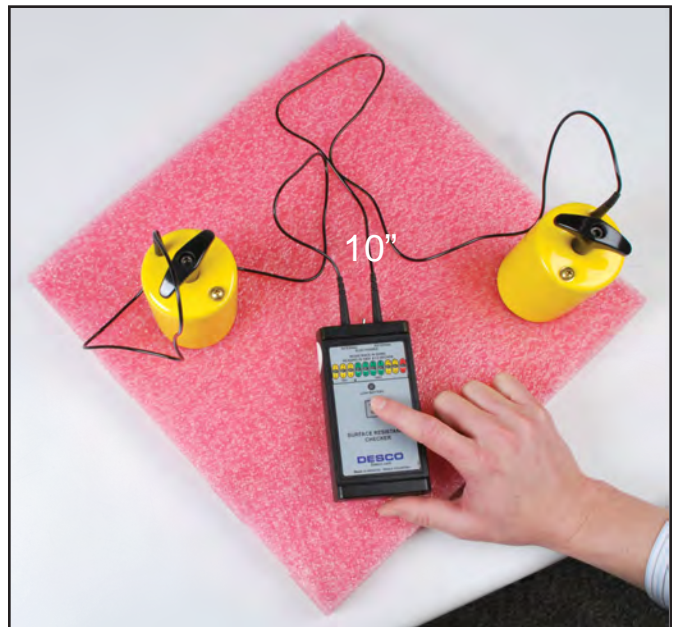
Figure 5. Using the test leads and two 5 pound electrodes to measure RTT