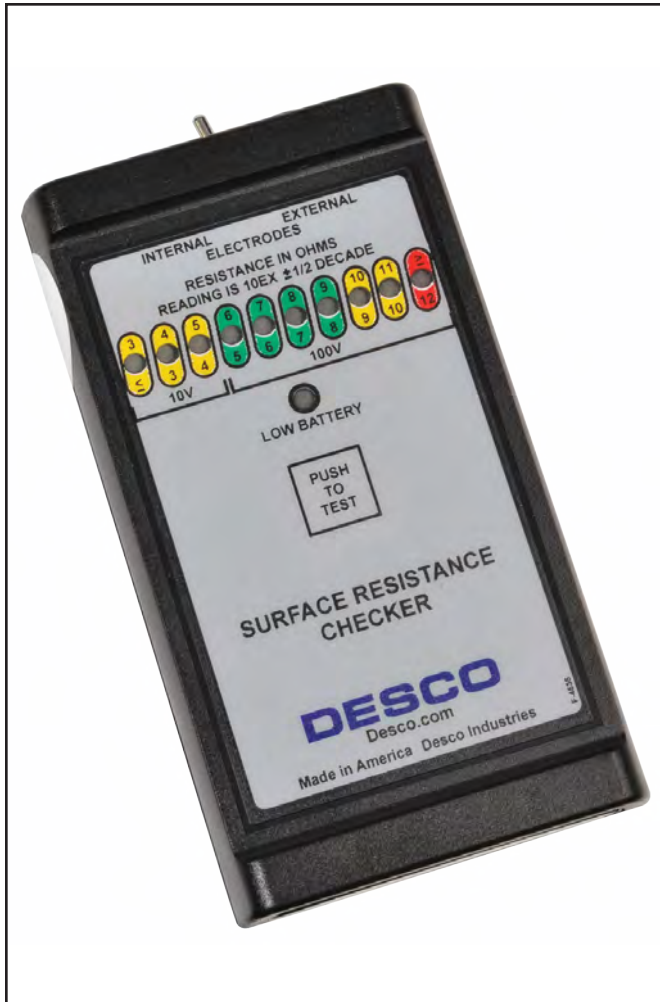
Figure 1. Desco 19640 Surface Resistance Checker