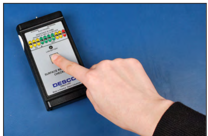
Figure 3. Using the internal parallel electrodes to measure surface resistance

NOTE: For worksurfaces, use Desco Item# 10435 Reztore™ Antistatic Surface and Mat Cleaner or other silicone-free ESD cleaner. Be sure the surface is dry before testing.