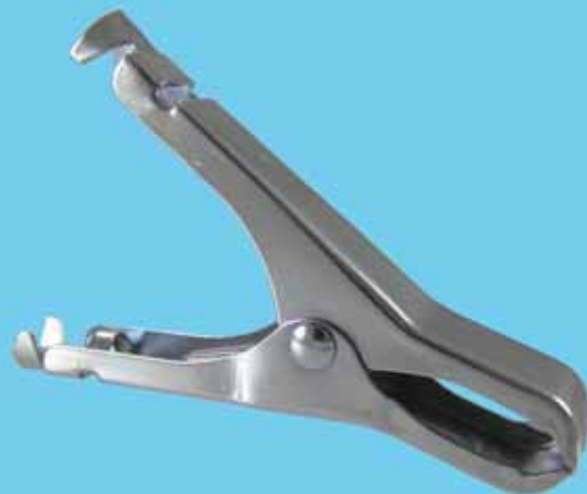
Small Charger Clip, Steel, Zinc Plated, 50 Amp