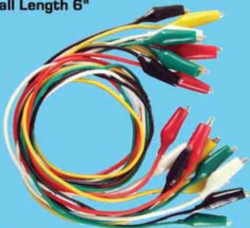
Multi-Color Insulated Lead Set