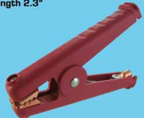
Fully Insulated Heavy Duty Clamp with Serrated Copper Teeth, 500 Amp