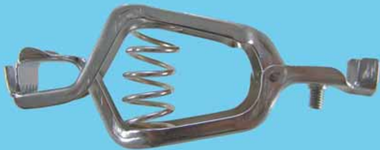
Clip, Steel, 50 Amp