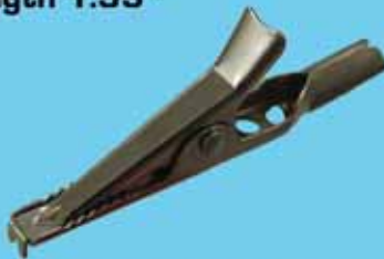
Alligator Clip, Steel, Fang Tooth with Barrel