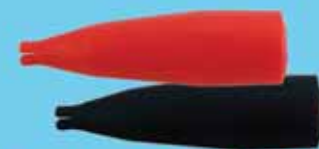
Insulator for 502008 Series