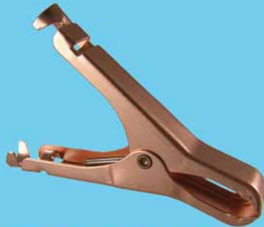
Small Charger Clip, Steel, Copper Plated, 50 Amp