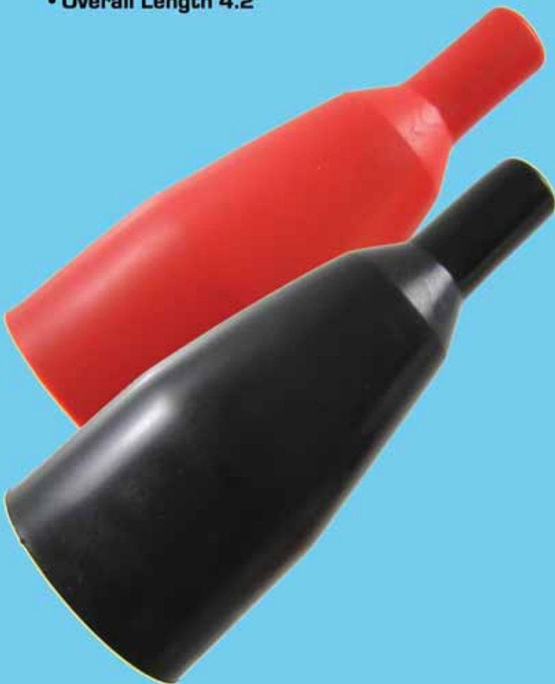
Insulator for 501790 Series