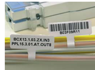
▶ Tags for small diameter cables. PTLFT-01-425