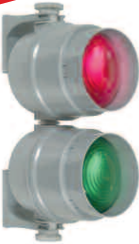
Fixing Bow for (LED) Beacons 890 (Beacon not included in assembly)