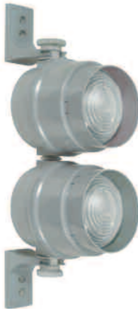
The fixing bow can be mounted pointing inwards or outwards