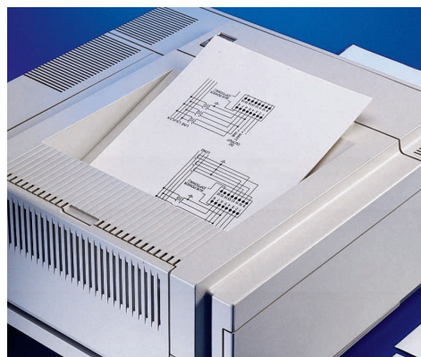
Available in 8.500" x 11.000" sheets for prototyping labels when you wish to cut your own sizes.