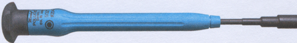
Fixed ESD-Safe Handle (short) Available as complete drivers only

Featuring a chuck style nose, these ESD-Safe handles are ergonomic, Anti-Static and accept traditional Moody screwdriver blades as well as the 3" Extension. Non-roll tops and fluted bodies. OAL 4.5"