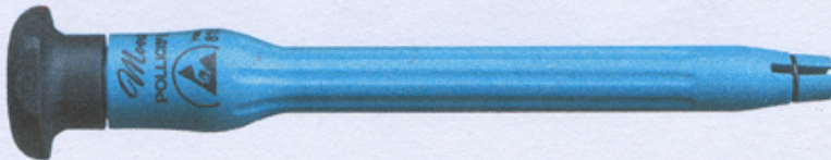
Interchangeable ESD-Safe Handle for 2-in-1 Reversible Blades Stock No. 49-8182

Now featuring a pocket clip, these blue anodized aluminum handles are for use with our 2-in-1 reversible screwdriver blades. Non-roll top and knurled handle ensure a good grip, and snap ring secures blade tightly. OAL 2.7"