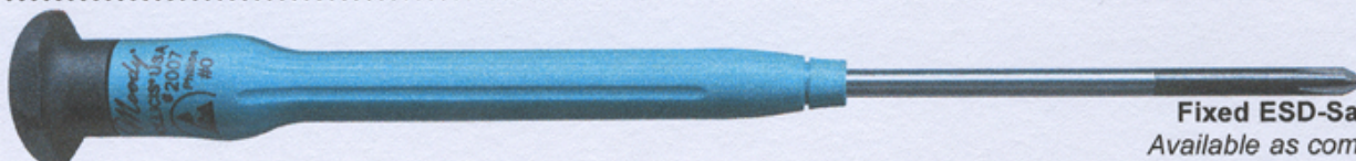
Fixed ESD-Safe Handle (long) Available as complete drivers only

Ergonomic and Anti-Static, these handles feature securely molded blades. Complete with Swiveltop™, these are available as complete drivers only, both individually and in sets. Drivers are marked with the size, stock no. & ESD-Safe symbol. Blade length 1.25"; OAL, incl. blade, 4.9"