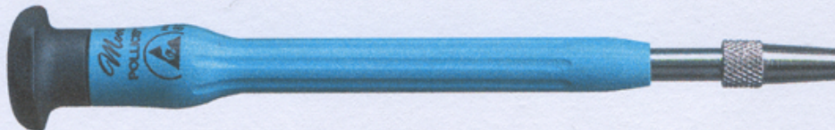
Interchangeable ESD-Safe Handle for Moody's Jewelers Style Blades Stock No. 49-8181

These Ergonomic and Anti-Static (ESD-Safe) handles accept our 2-in-1 reversible screwdriver blades, and feature hex-shaped tops and fluted bodies. Snap-ring secures blade in place. OAL 3.75"