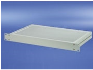
Photo shows 1 U