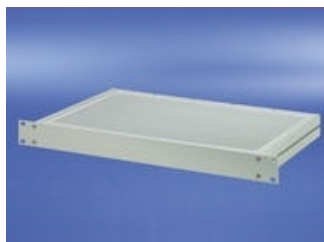
Photo shows 1 U