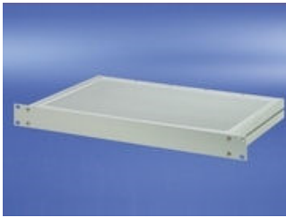
Photo shows 1 U