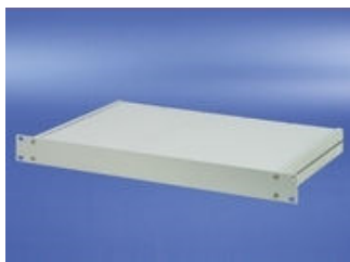
Photo shows 1 U