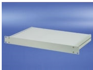
Photo shows 1 U