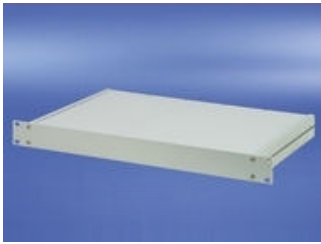
Photo shows 1 U