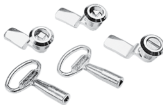
Top left to right: AL32, AL35. Bottom left to right: AL32Y, AL35Y, AL31

Fits Type 4 and 12 enclosures which have external screw clamps. Requires only a quarter-turn (90 degrees) to open or close. An internal O-ring and external gasket assure a water-tight and dust-tight seal. Installation requires a hole punched or drilled in the door for each latch. Complete instructions are furnished. A square or triangular key is required for tamper-resistant latches. Latch is die-cast zinc with chrome finish.