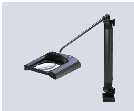
SNL 319 A