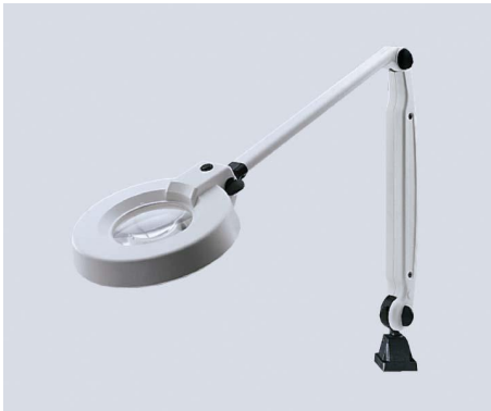
RLL 122 T